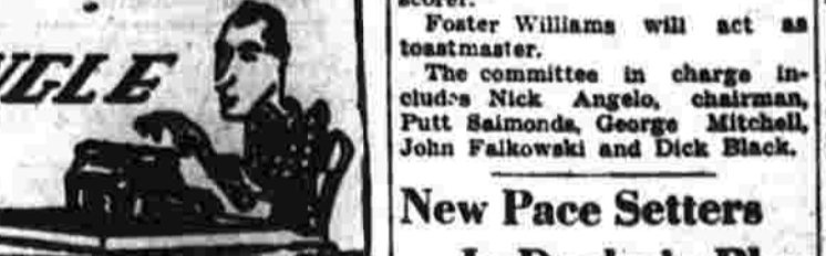
HERALD ANGLE logo with 'SPORTS EDITOR' text below it.